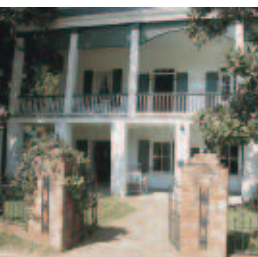
Kate Chopin House